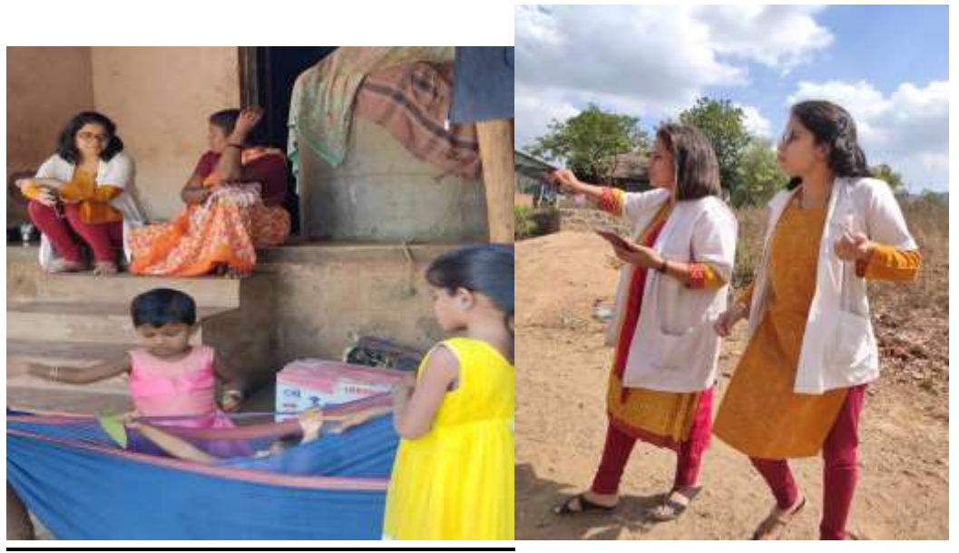
Documentary shooting at Dhamani Title-11 Seconds Maternal and Child Health