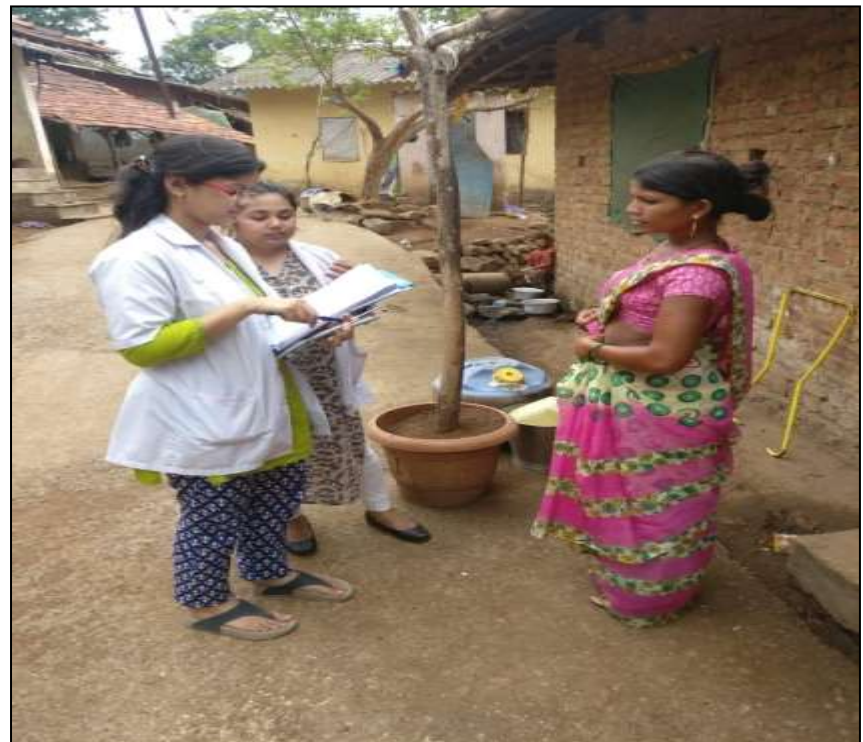
lGATS Tobacco Survey