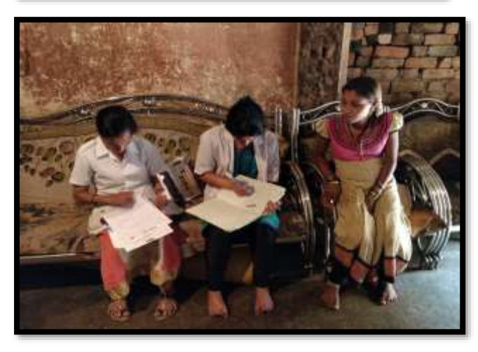
ANC and PNC follow up visit

Drawing Competition on occasion of Republic day