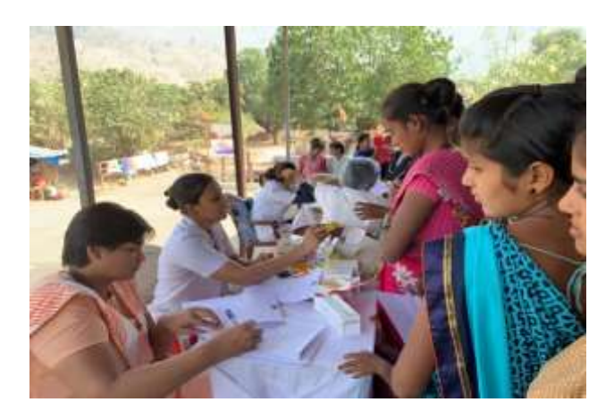
MJPJAY Multispeciality camp