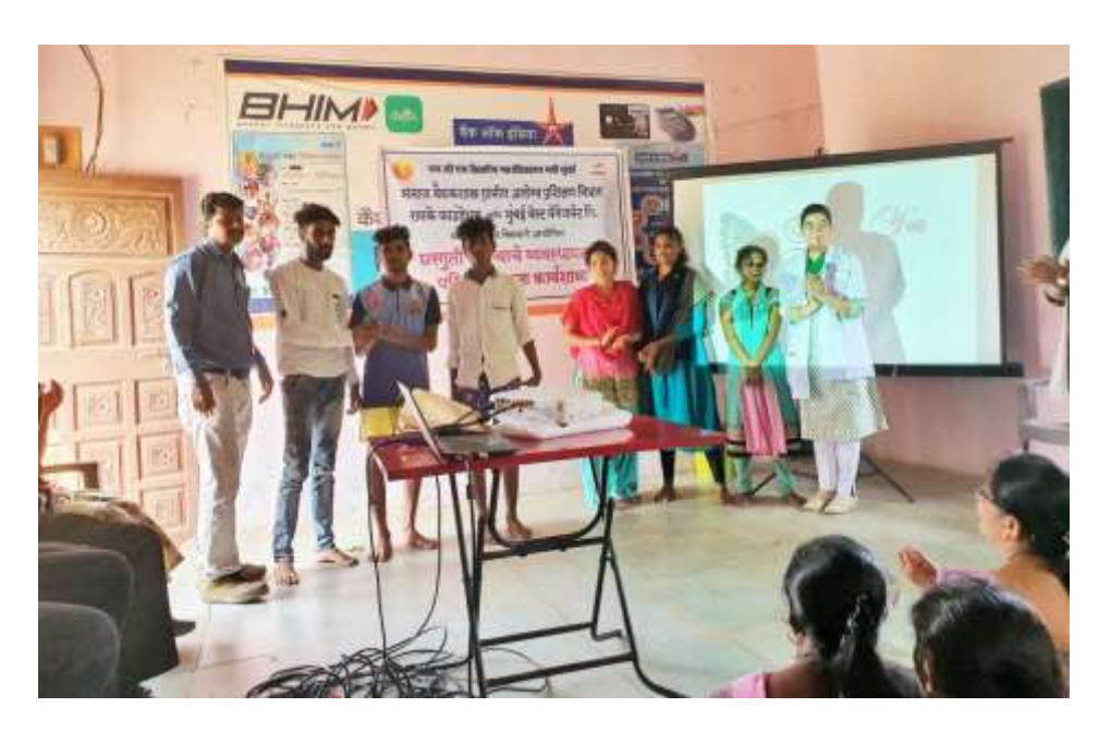
'Village Health Squad' was formulated comprising of the enthusiastic and forthcoming Youth of Dehrang village.

A Training of Trainers (TOT) on Domestic Waste Management was conducted at Dehrang