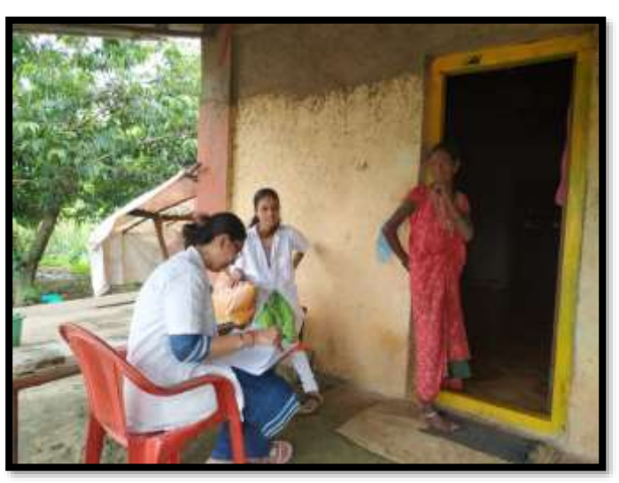
Integrated TB,leprosy and NCD Survey at Dehrang