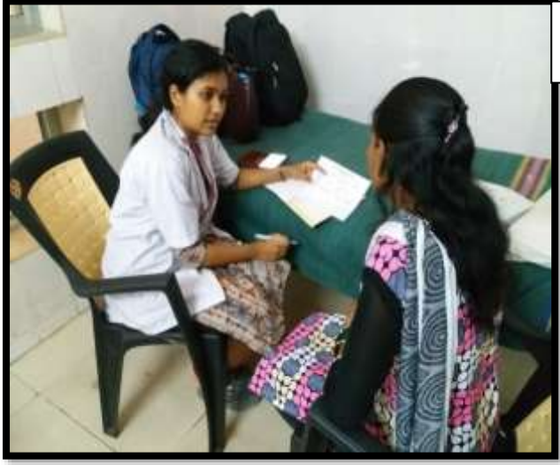
Screening of pregnant women as a part of ANC care