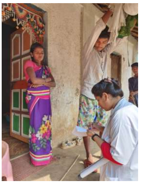
Formation of Health Squad