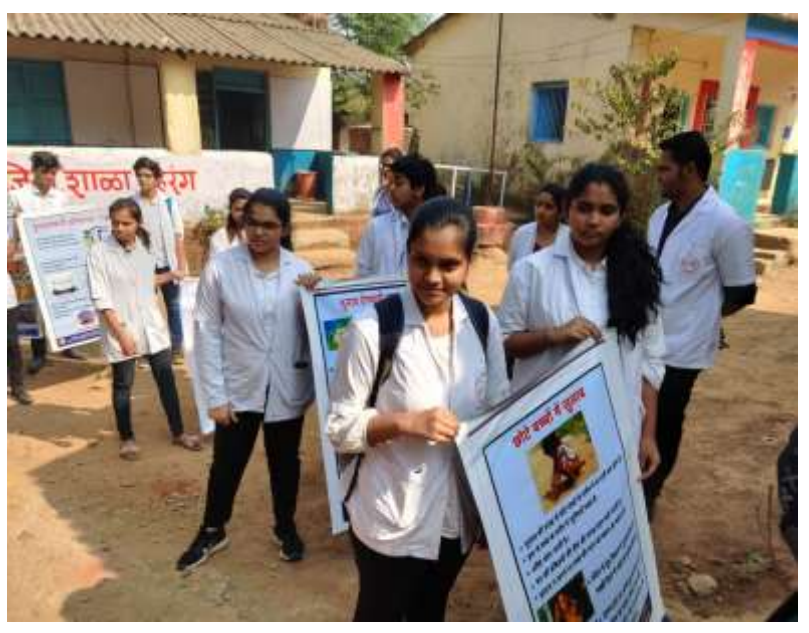
Swacchta Rally conducted by First MBBS Students