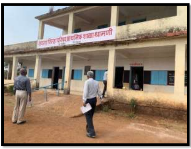
Visit to Z.P School for surveying present conditions of school toilet and discussion with headmistress of the school regarding basic sanitation and hygiene conditions of the school.