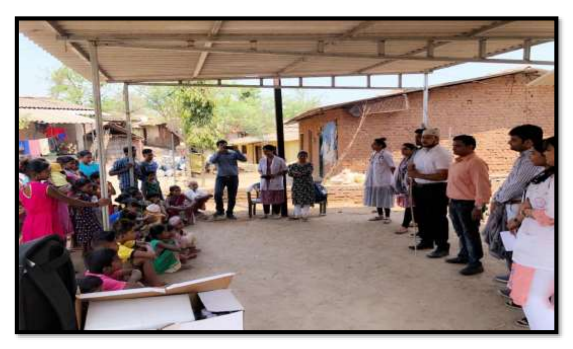
World Malaria Day Celebration