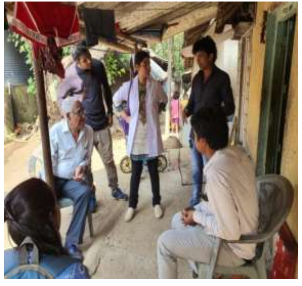
Discussion with Ex Sarpanch regarding Reactivation of Bore Well