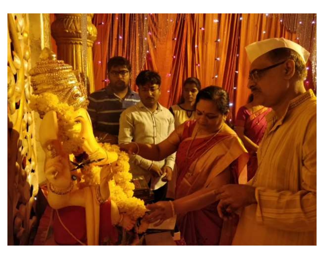
Ganpati Festival with UG and PG students