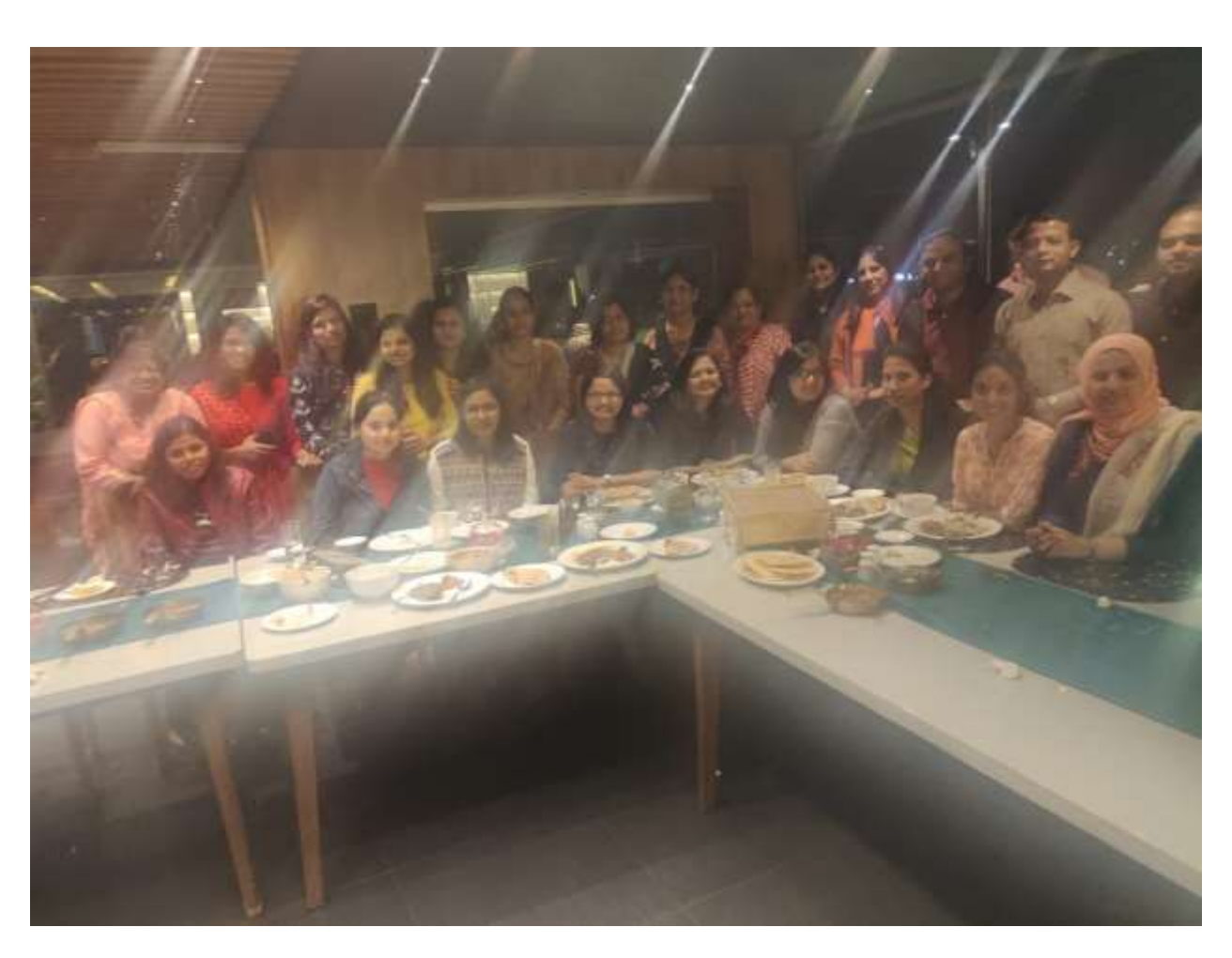
Celebration of Eid