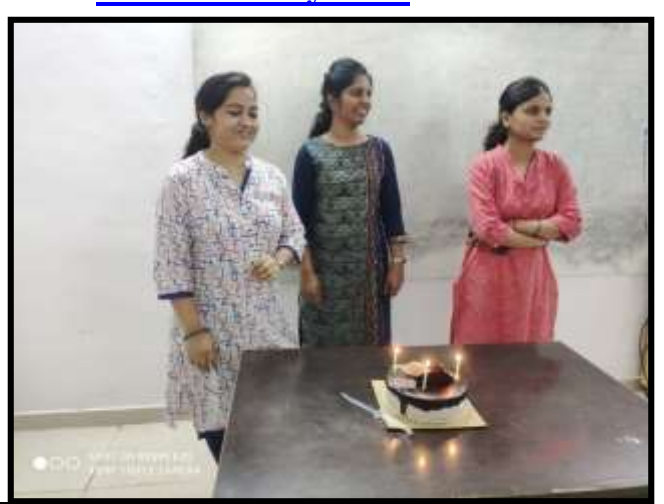
Group Photograph of Staff