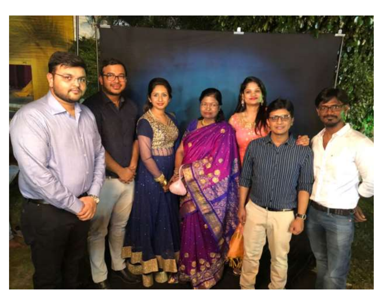
Get together at Diwali