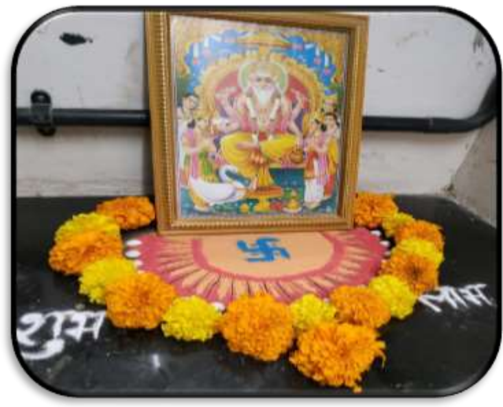
Photograph of Lord Vishwakarma