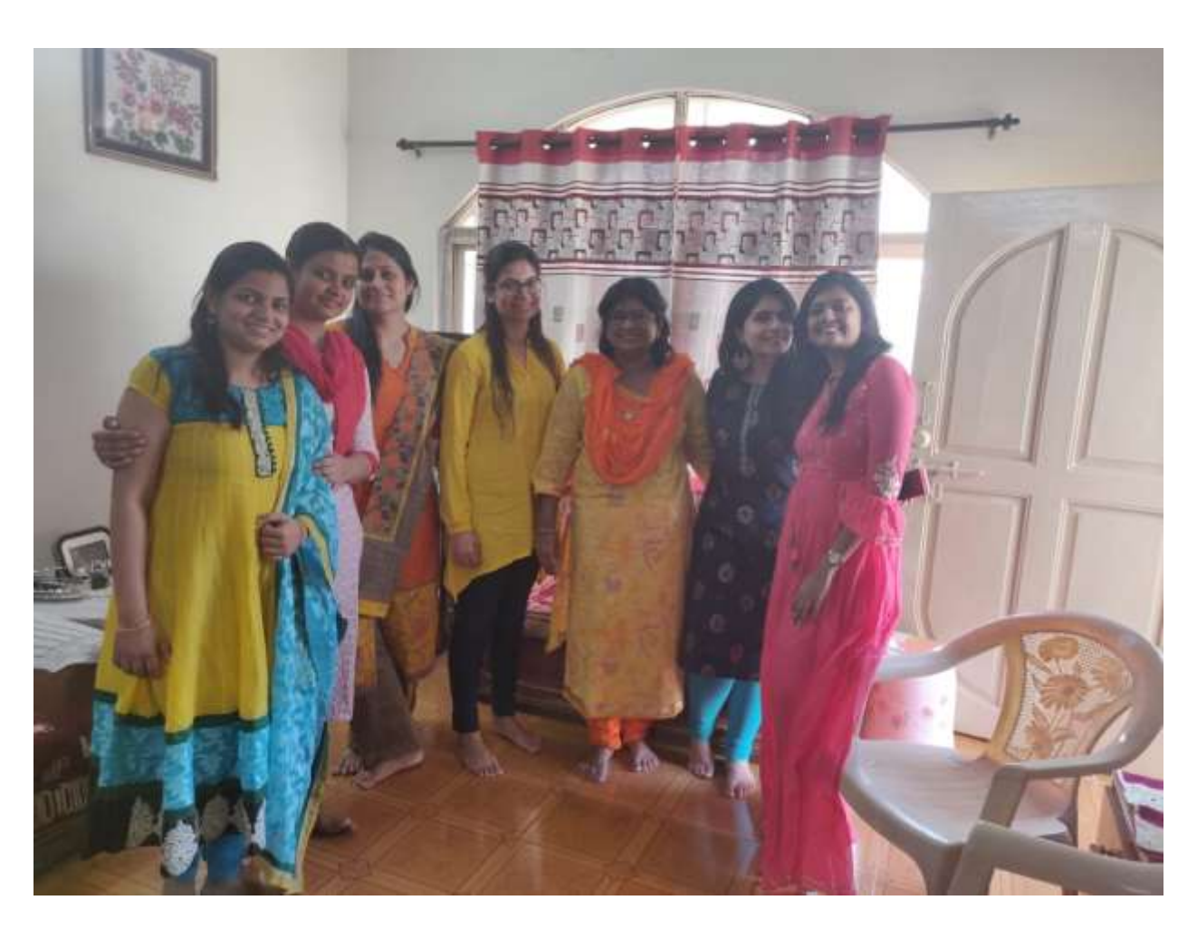
Get together at Home for 'Diwali Faral'