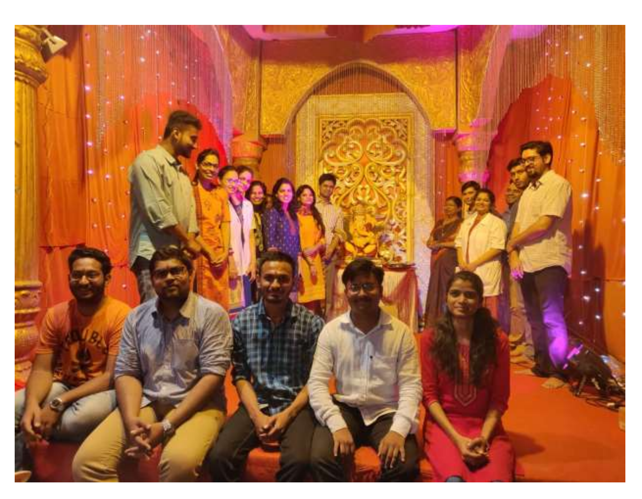
Ganpati Festival with UG and PG students