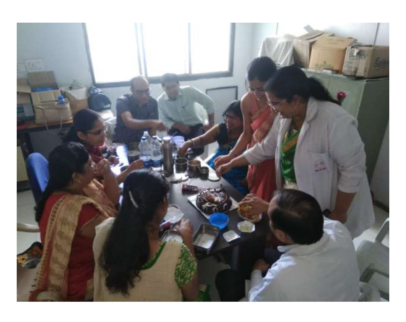
Women's day celebration organized by PG students