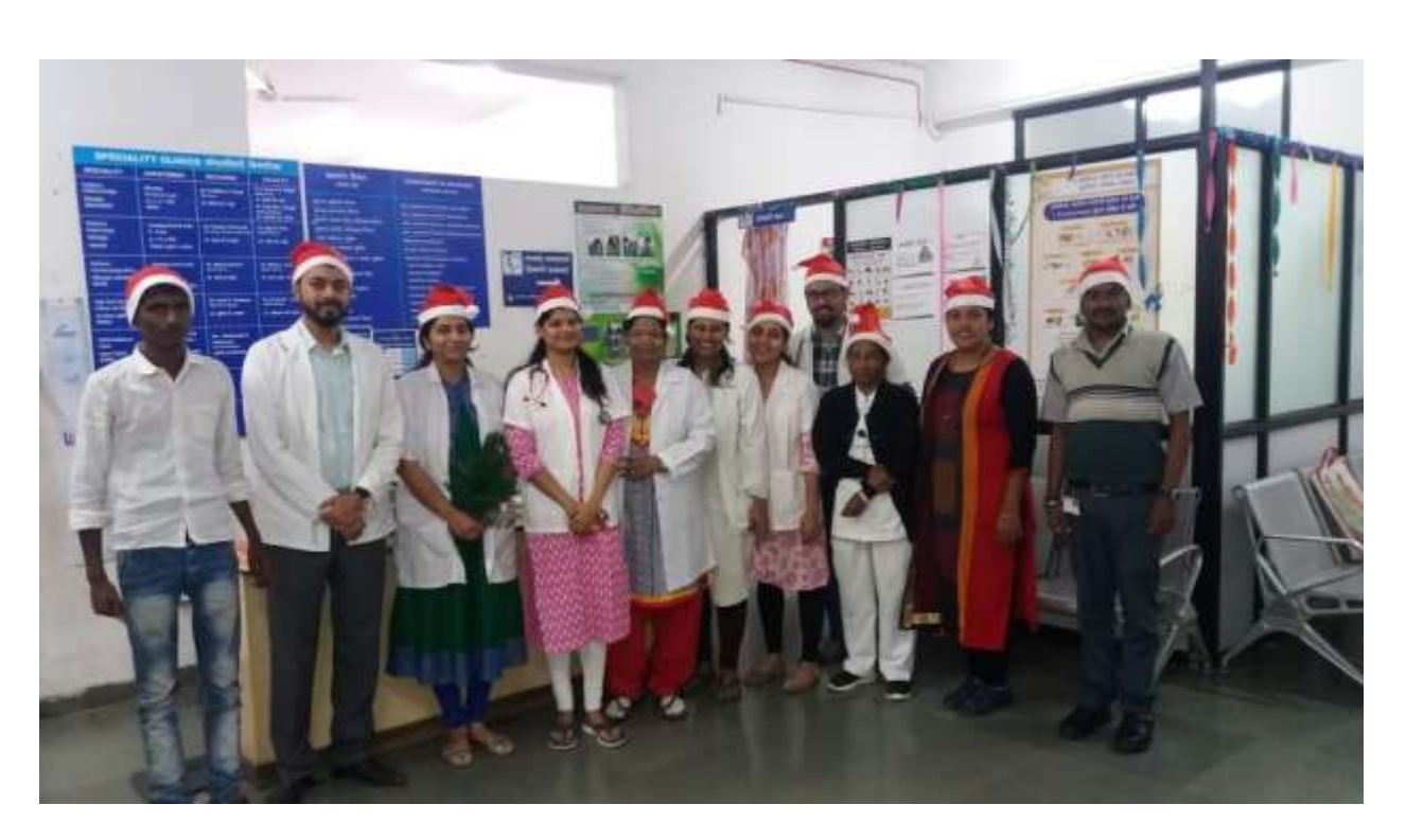
Christmas Celebration in Pediatric OPD