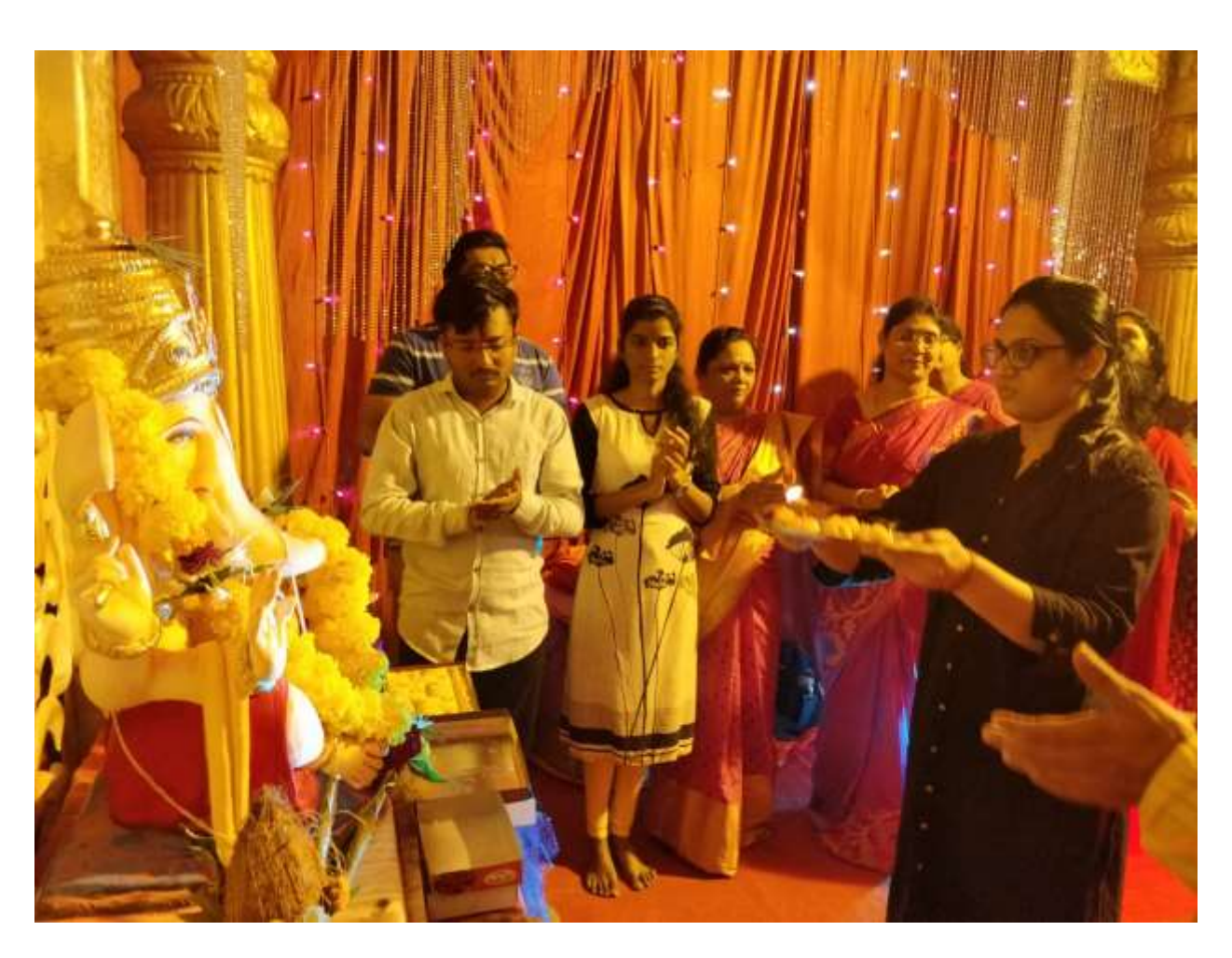
Ganpati Festival with UG and PG students