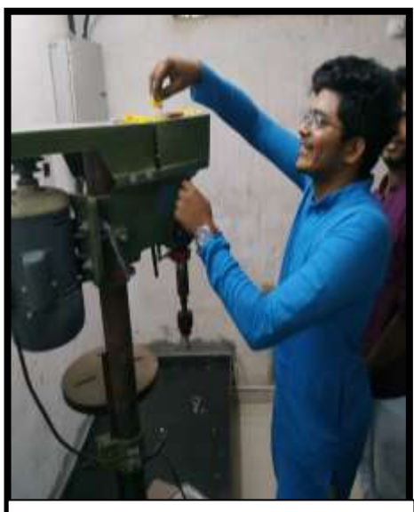
Photograph of Student performing Machine Pooja