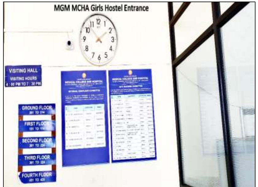
CCTV Cameras at Girls Hostel, Aurangabad