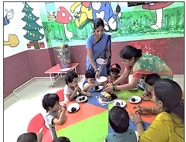
Day Care crèche facility at Navi Mumbai