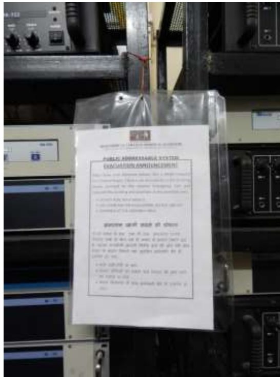
Public address system for emergency announcements