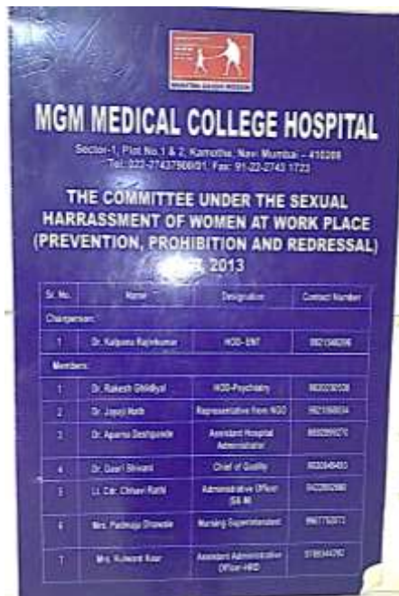
Signboard: Committee for prevention of sexual harassment of women at workplace at Navi Mumbai

Grievance Redressal Committee, Gender Sensitization Committee and Internal Complaints Committee works to address issues at workplace and to ensure safety and security of students and staff.