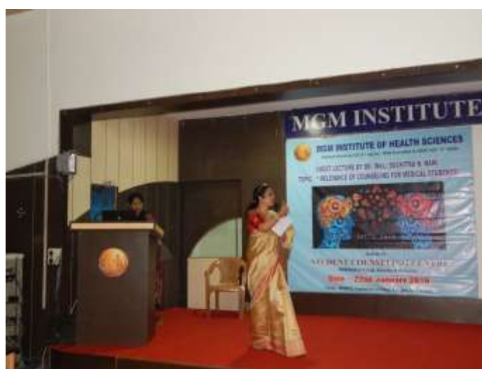
Activity at Students' Counselling Centre, Navi Mumbai