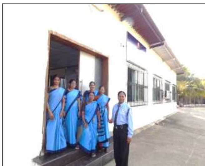
Female security guards at Navi Mumbai Campus