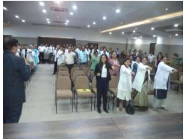
Self-defence counselling and training program at Aurangabad