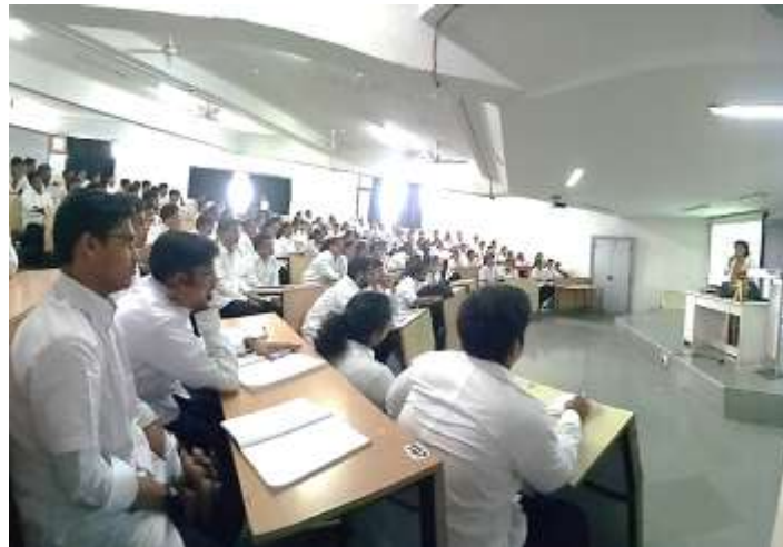
Gender sensitization: POCSO Awareness workshop, Aurangabad

Talks and workshops on Gender sensitization, and Self-defence training programs are conducted. Gender Champion Committee has been constituted. Students are sensitized about the Protection of Children from Sexual Offences (POCSO) Act.