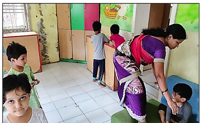
Day Care crèche facility at Aurangabad