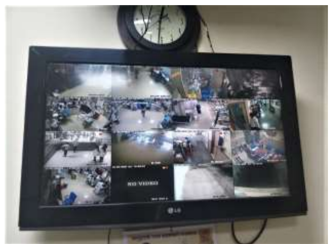
Central monitor with CCTV feeds in Medical Superintendent's office