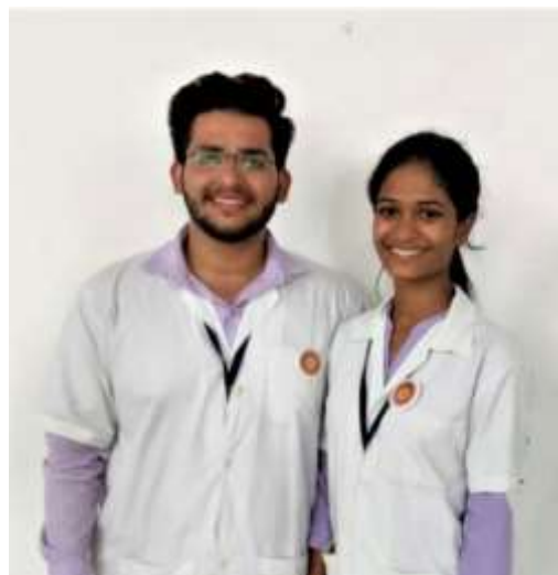
Student Gender champions 2018-19 batch