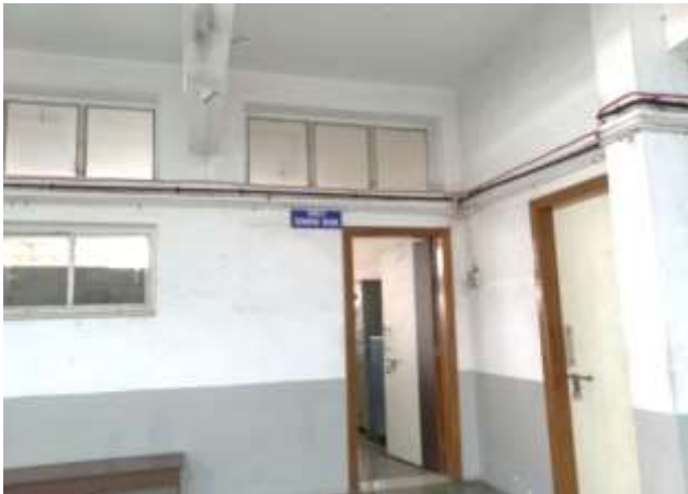
Girls' common room, Navi Mumbai

There are separate Common Rooms for boys and girls, equipped with lockers, newspapers, indoor game facilities and washrooms.