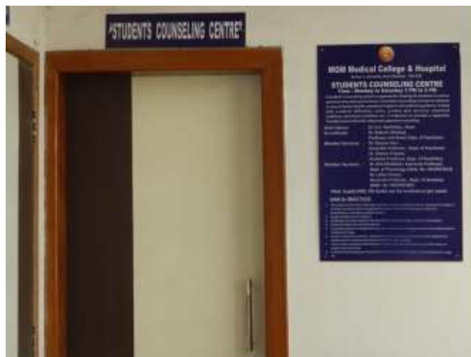
Students' Counselling Centre, Navi Mumbai