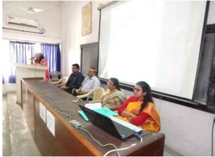
Gender sensitization & POCSO Awareness workshop, Navi Mumbai