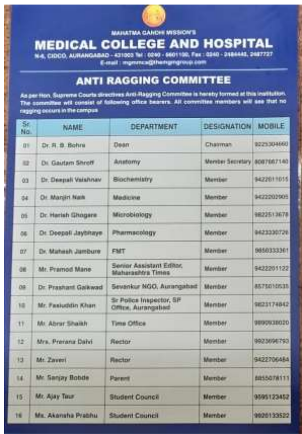
Signboard for Anti Ragging Committee at Aurangabad