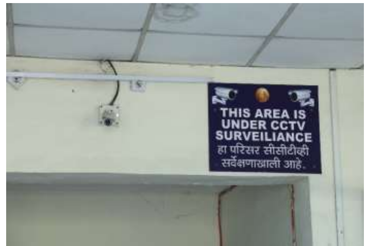
CCTV Cameras at Girls Hostel, Navi Mumbai