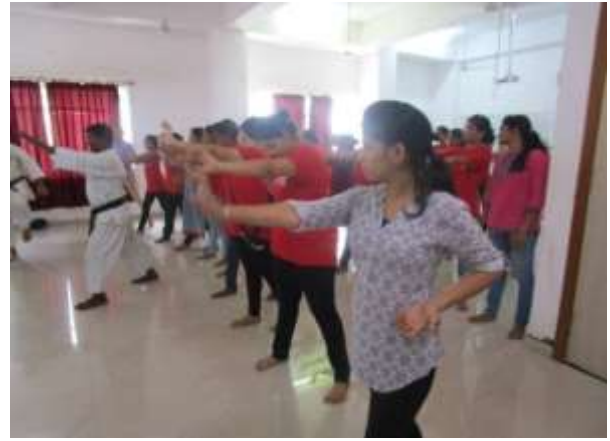
Self-defence counselling and training program at Navi Mumbai