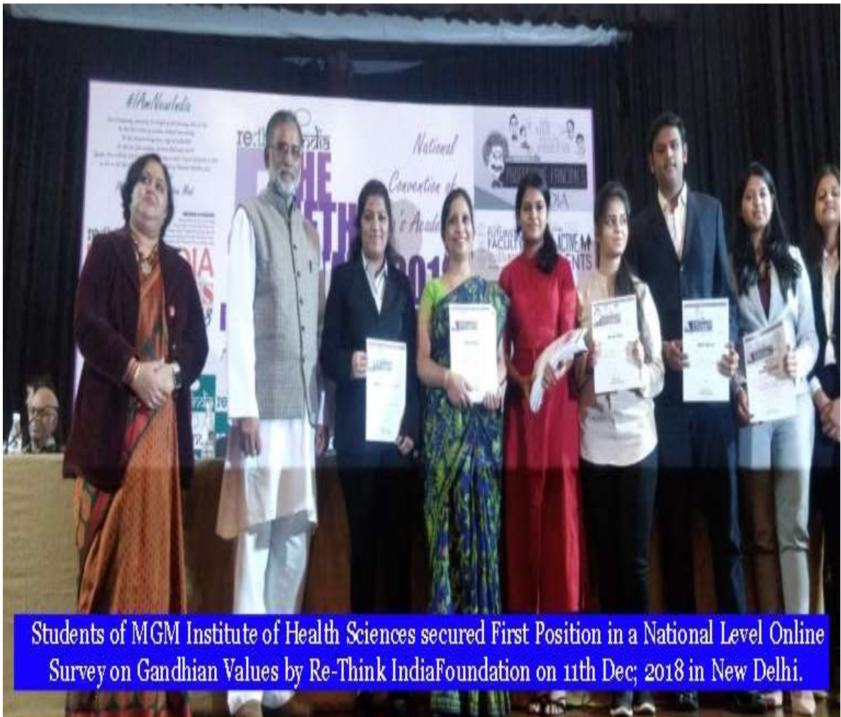
Students of MGM Institute of Health Sciences secured First Position in a National Level Online Survey on Gandhian Values by Re-Think India Foundation on 11th Dec; 2018 in New Delhi.