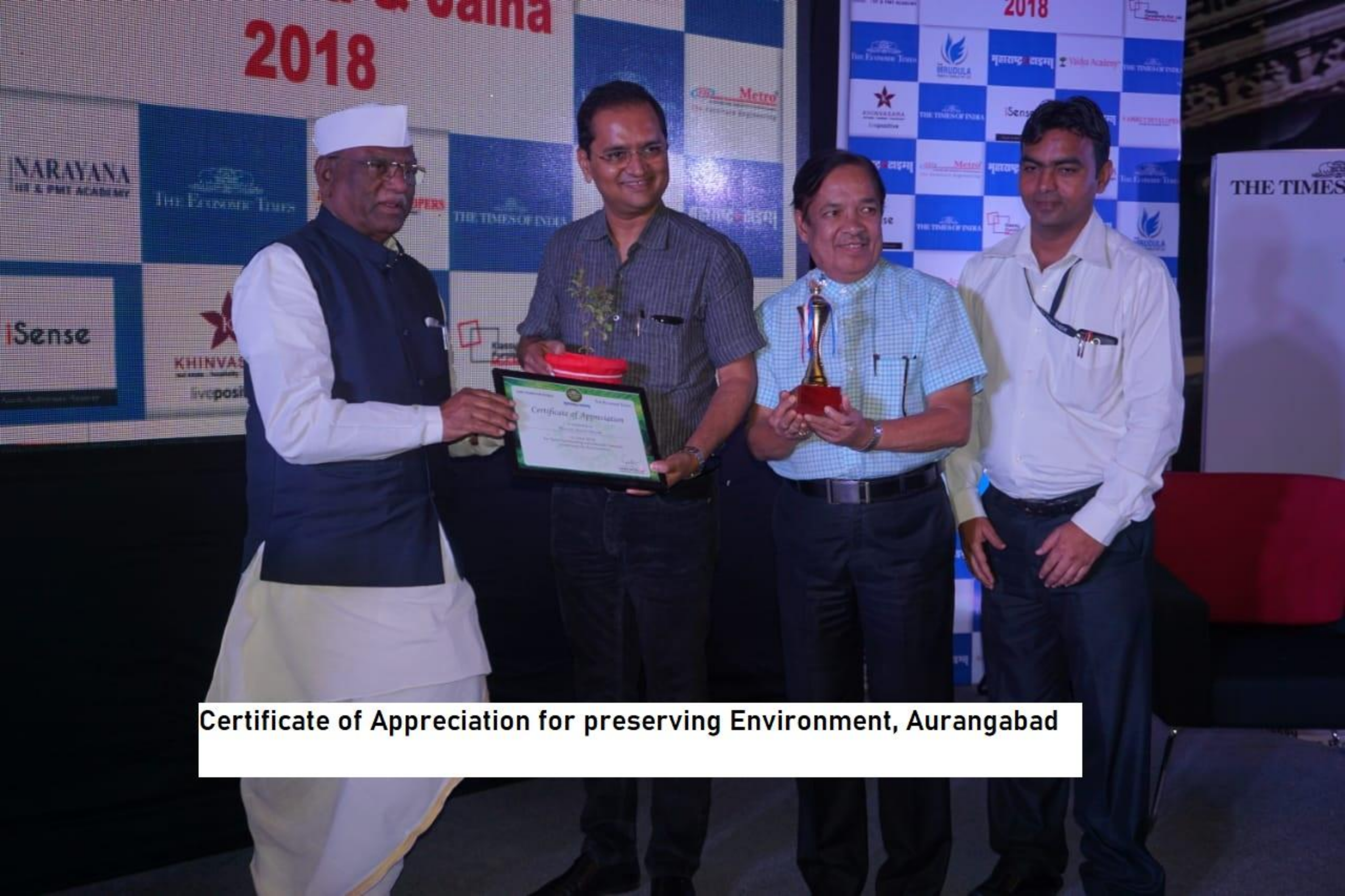
Certificate of Appreciation for preserving Environment, Aurangabad