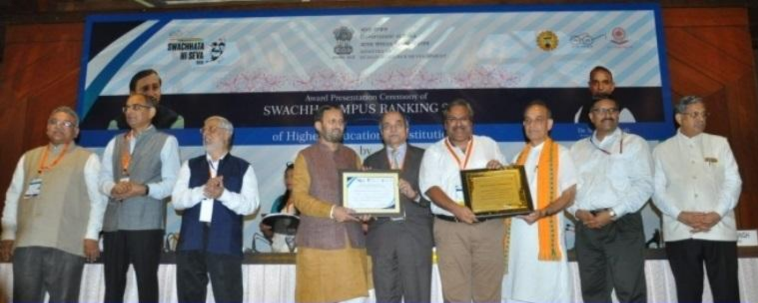
MGM's Medical College & Hospital awarded 3rd Rank at National Level "Swacch Campus Ranking-2018" in the presence of Hon'ble Shri Prakash Jawdekar (Minister, HRD) & Hon'ble Shri Satyapal Singh (State Minister, MHRD) on 1st Oct; 2018.