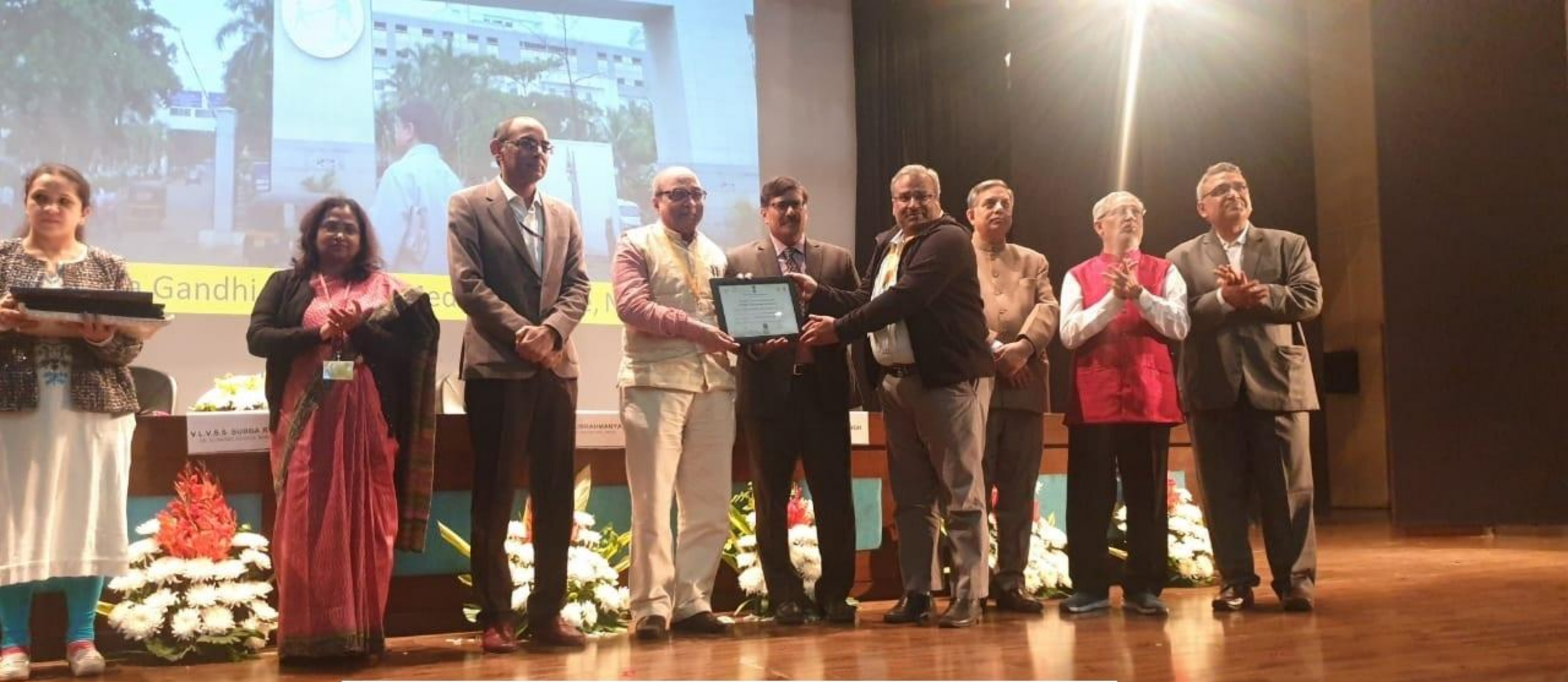
Swachh campus Ranking Award 2019-Navi Mumbai