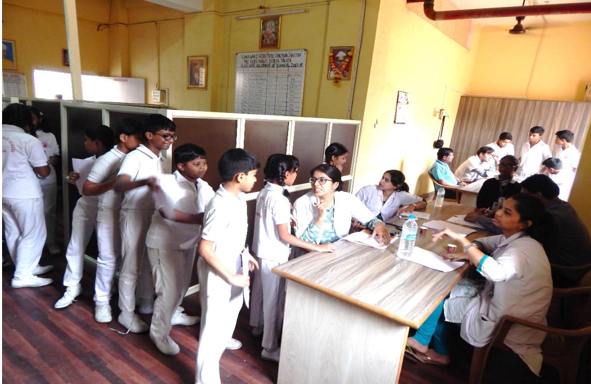
Taloja school Health check-up camp conducted by MGM Medical college, Navi Mumbai.