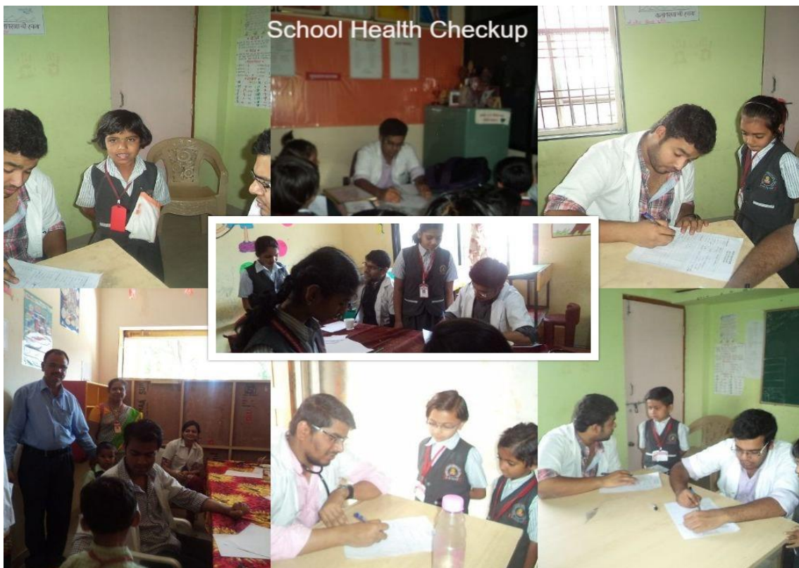
Multidiagonistic camp at ZP School Borsar Kannad Aurangabad 2015-16