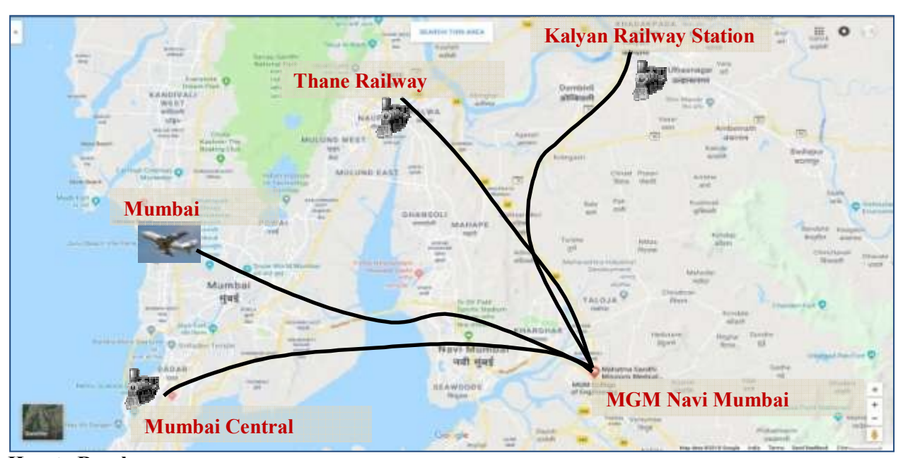
How to Reach Nearest Airport is – Mumbai Airport (40 Km)

1. MGM Education Campus, Navi Mumbai is located at start of Mumbai – Pune Express Highway, Sector – 01, Kamothe, Navi Mumbai – 410 209