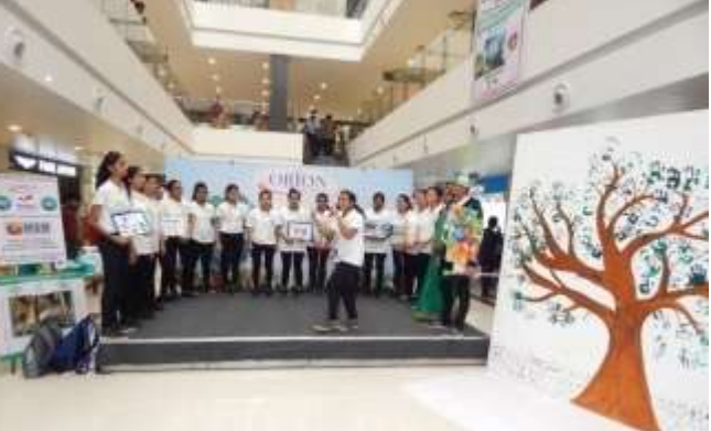
Page 25 of 31