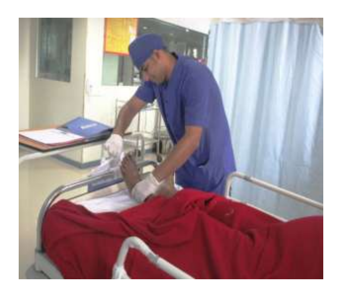
Nurse Practitioners in Critical Care Unit