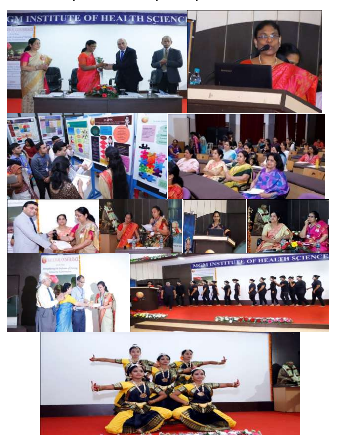
Page 26 of 31

Theme : Strenthening the Profession of Nursing: Enhancing Transformation